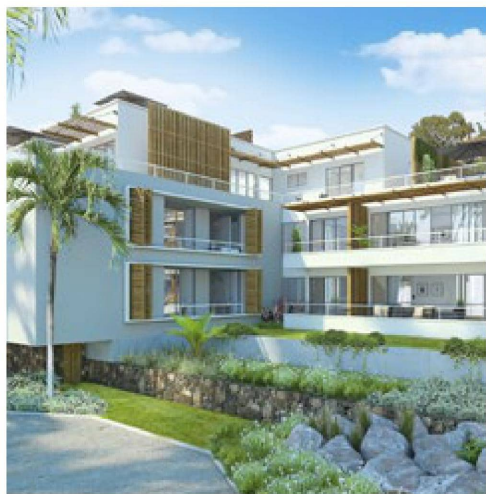
TAMARIN BAY La Baie de Tamarin